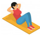
(to) do sit-ups /'sɪt ʌps/