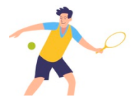
(to) play tennis /'tenɪs/