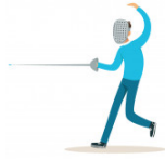
(to) do fencing /'fensɪŋ/