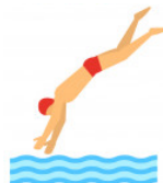
(to) dive /'daɪv/