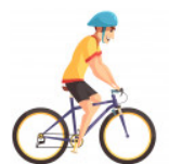
(to) bike (to) go biking / cycling /'saɪkɪŋ/