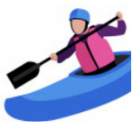
(to) go canoeing (to) go kayaking /'kɑ:'nu:ɪŋ/ - /'kaɪækɪŋ/