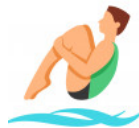
(to) dive-bomb /'daɪv bɒm/