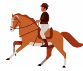
(to) do Horse-riding /'hɔ:s raɪdɪŋ/