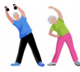
(to) work-out Faire de l'exercice