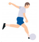
(to) play football /'fʊtbɔ:l/ (to) play soccer /'sɒkə(r)/