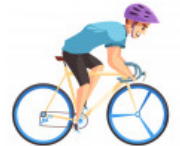
(to) go mountain-biking /'maʊntən baɪkɪŋ/